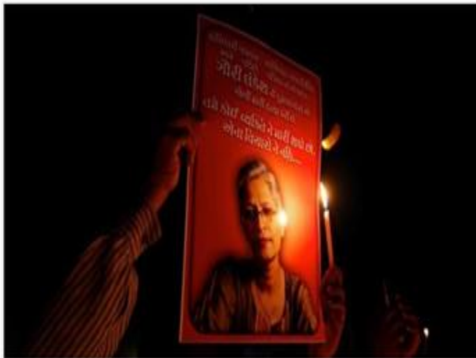
People hold placards and candles during a vigil for Gauri Lankesh, a senior Indian journalist who according to police was shot dead outside her home on Tuesday by unidentified assailants in Bengaluru, in Ahmedabad on September 6, 2017.