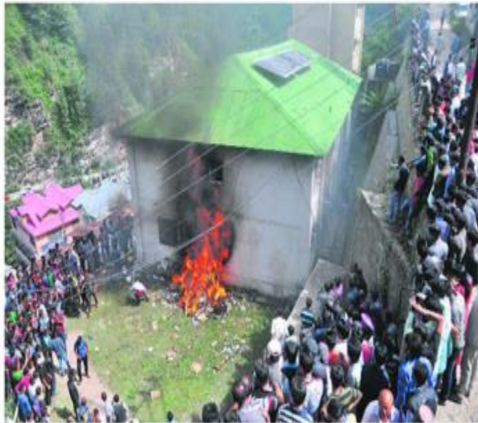
A file photo of protesters setting the police station on fire at Kotkhai.

Bhanu P Lohumi Tribune News Service Shimla, December 6